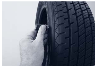
Fig. 5: Measurement of the rubber thickness outside on the sidewall up to the steel carcass (max. 6.5 mm) with probe F10-1.