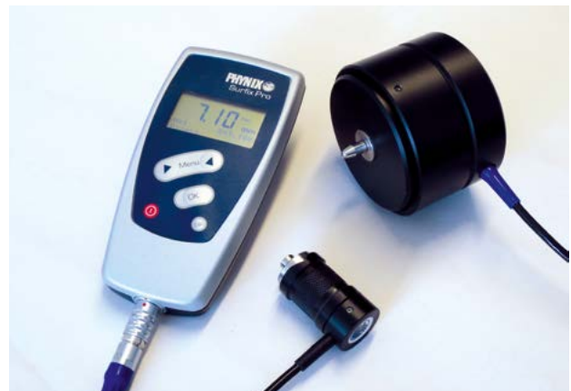
Fig.2: Coating thickness gauge Surfix® Pro S-CT with probes F 30-T and F10

Gauge Surfix® Pro S-CT with rubber protective cover, calibration standard(s), probe(s) according to order, two AA batteries, data transfer program, instruction manuals and manufacturer's certificate, all in a rugged plastic carrying case, the probe F 30-T is delivered in a soft carrying pouch.