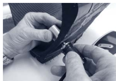
Fig. 8: Measurement of total rubber thickness of the side wall with fabric carcass (max. 10 mm) with probe F10-cp and Fe counter pole.