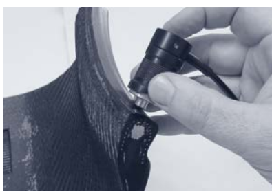
Fig. 7: Measurement of rubber thickness on the bead up to the steel mesh (max. 6.5 mm) with probe F10-3.