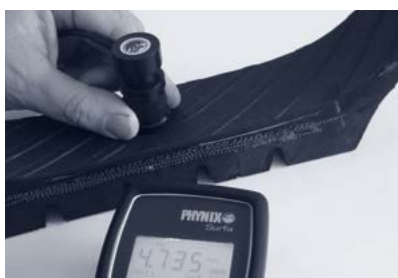
Fig. 6: Measurement of the rubber thickness inside beneath the tread up to the steel mesh (max. 6.5 mm) with probe F10-2.