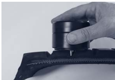
Fig. 4: Measurement of the under-tread thickness in the grooves of the tread up to the steel mesh (max. 10 mm) with probe F 30-T and steel pin.