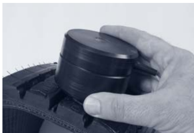
Fig. 3: Measurement of the rubber thickness on the running surface up to the steel mesh (max. 30 mm) with probe F 30-T.